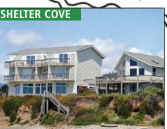
Shelter Cove Oceanfront Inn Oceanfront rooms with large private balconies, flat screen TVs, famous "Cove Restaurant" is on the premises.

While driving on Humboldt County roads, please be courteous, cautious and careful. Use turnouts so others may pass. Do not tailgate or cross over the center line. While picnicking and hiking Humboldt County and it's many trails, creeks, rivers and roads, please pack out what you bring in. Recycle and dispose of all trash properly. Thanks!