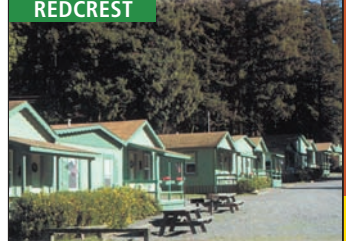
Redcrest Resort & Gift Shop One & two bedroom cottages under the redwood canopy. www.redcrestresort.com