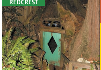
Eternal Tree House, Cafe & Gift Shop Don't miss the 20-foot room inside a 2500 year-old living redwood tree. Free admission!