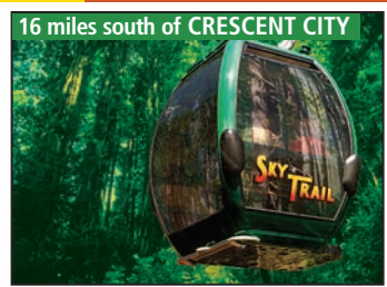
Trees of Mystery™ —Experience spectacular redwoods. Ride the SkyTrail™ gondola. Visit our museum. Walk trails among unique redwood carvings.

While cruising the Avenue tune into "KMUD" REDWOOD COMMUNITY RADIO So. Humboldt ..... 91.1 FM Shelter Cove ..... 99.5 FM No. Humboldt ..... 88.3 FM No. Mendocino ..... 90.3 FM or online at kmud.org