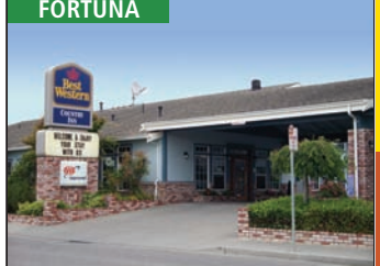
Best Western Country Inn Enjoy our family atmosphere in the heart of the Redwood Coast. --