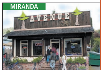
Avenue Cafe offers a good variety of home-made American, Italian and specialties. Breakfast, lunch and dinner.