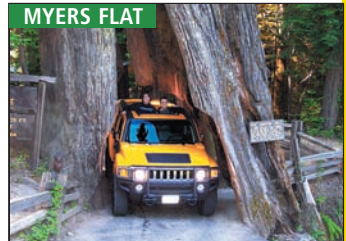
Shrine Drive Thru Tree An unforgettable experience for all ages on the "Avenue of the Giants." Don't miss it!