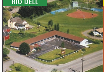
Humboldt Gables Motel Gateway to the "Avenue of the Giants". HumboldtGables.com (707) 764-5609