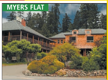
Myers Country Inn —The only bed & breakfast on the Avenue. View the tallest trees from your veranda. Great breakfast!