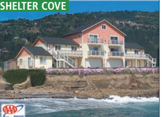
The Tides Inn features ocean front rooms and suites with balcony, fireplace and some with full kitchens.

SERVICES on and NEAR the "Avenue of the Giants" FUEL convenient to the Avenue—Piercy, Garberville, Redway, Miranda, & Rio Dell MARKETS —Garberville, Redway, Phillipsville, Miranda, Myers Flat, Scotia & Rio Dell FARMER'S MARKETS —(May—October) Garberville ..... Fri. 11 AM - 3 PM Miranda ..... Tue. 2 PM - 5 PM Ferndale ..... Sat. 10:30 AM - 2 PM Shelter Cove ..... Tue. 11 AM - 3 PM