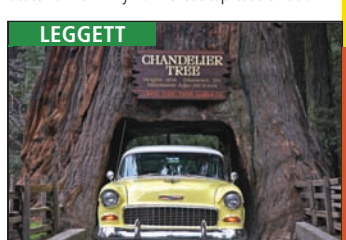
Chandelier Drive-thru Tree Scenic 200 acre park, redwood grove, gift shop, picnic area, rest rooms.