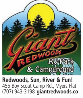
Redwoods, Sun, River & Fun! 455 Boy Scout Camp Rd., Myers Flat (707) 943-3198 giantredwoods.com

SHELTER COVE A unique seaside community offering an airport, golf course, superb lodging and fine dining, surrounded by volcanic black sand beaches, mountains and incredible coastal views. Shelter Cove boasts excellent ocean fishing, tidepools, beachcombing and mountain trail hiking, all at your doorstep. While touring the North Coast, a visit to Shelter Cove is definitely in order. During late April and all of May, check out the migrating whales just off shore. Don't miss visiting this secluded slice of paradise nestled between the King Range National Conservation Area and the majestic Pacific "Lost Coast".